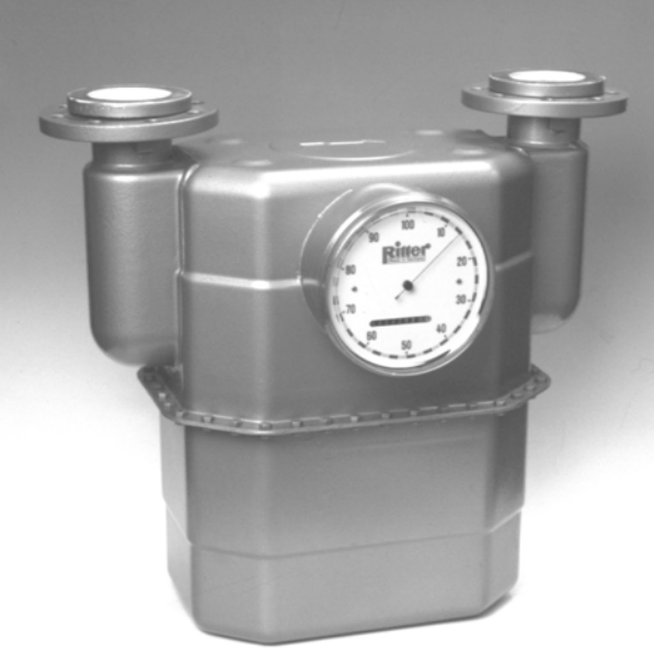
BG 40 (Fig. with "Adding Roller Counter")

Correcting factors which take into account gas type, temperature, humidity etc are therefore not necessary . It should be noted that with other, non-volumetric measurement processes, the measurement accuracy given for that process can only be achieved if the correcting factors for the immediate condition of the gas are <u>exactly</u> known.