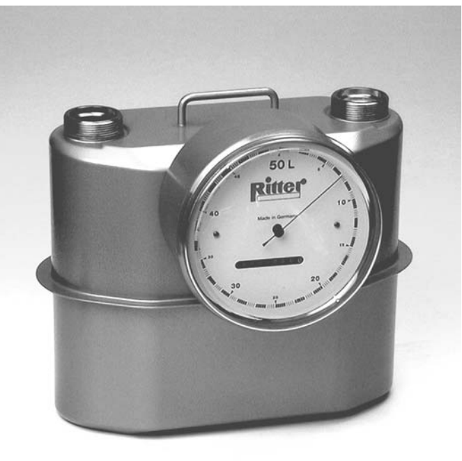
BG 10 (Fig. with "Adding Roller Counter")

The design of the measuring chamber is such that the measuring volume per cycle of the