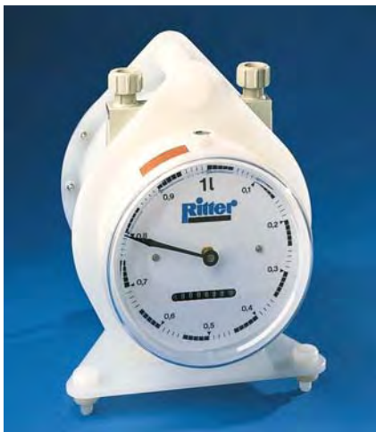
TG 1 Model 7 (PVDF)