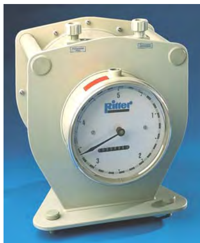
TG 5 Model 6 (PP)