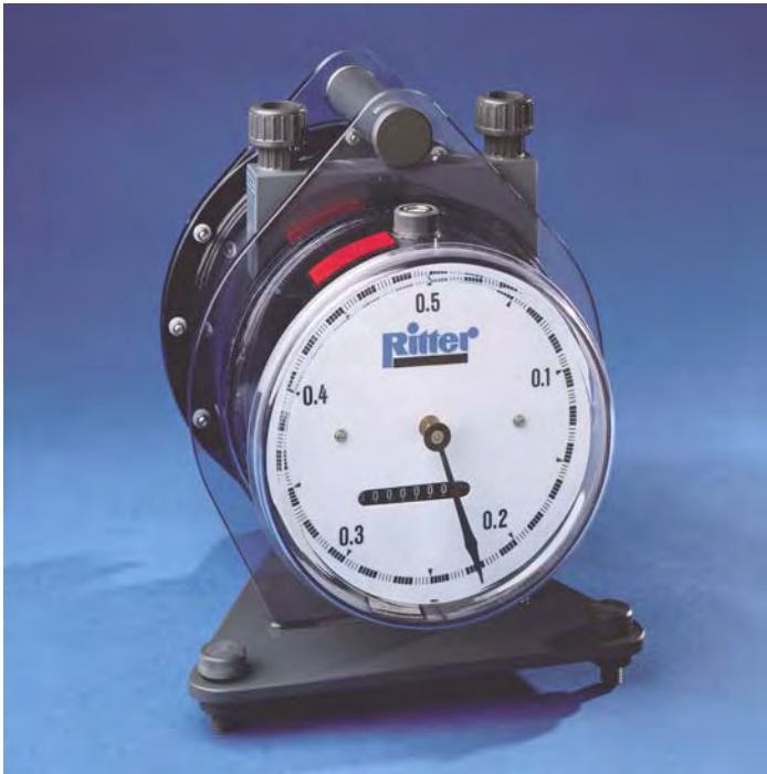
TG 05 Model 5 (PVC transparent)